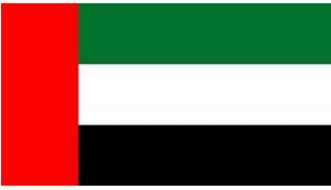
United Arab Emirates